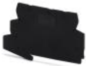
End cover for TERMITRAB TT-ST-..., width: 2.2 mm, color: Black