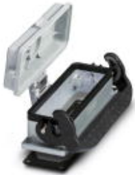
HEAVYCON panel mounting base HV6, with single locking latch, height 27 mm, with cover

Please be informed that the data shown in this PDF Document is generated from our Online Catalog. Please find the complete data in the user's documentation. Our General Terms of Use for Downloads are valid ( http://phoenixcontact.com/download )