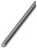
Connection pin, Length: 1000 mm, Color: gray