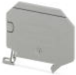
Partition plate, Length: 62.1 mm, Width: 2.2 mm, Height: 52.5 mm, Color: gray

DIN rail perforated - NS 35/ 7,5 PERF 2000MM - 0801733