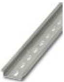
DIN rail, material: steel galvanized and passivated with a thick layer, perforated, height 7.5 mm, width 35 mm, length: 2000 mm

DIN rail perforated - NS 35/ 7,5 PERF 2000MM - 0801733