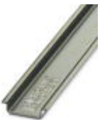
DIN rail, material: Steel, unperforated, height 7.5 mm, width 35 mm, length: 2 m

DIN rail - NS 35/ 7,5 UNPERF 2000MM - 0801681