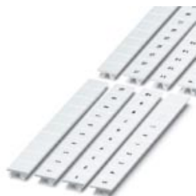
Zack marker strip, 10-section, vertically labeled with the consecutive numbers: 21 ... 30, white

Please be informed that the data shown in this PDF Document is generated from our Online Catalog. Please find the complete data in the user's documentation. Our General Terms of Use for Downloads are valid ( http://download.phoenixcontact.com )