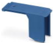
Covering hood, Connection method: Bolt connection, Width: 29 mm, Height: 33 mm, Color: blue