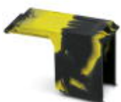
Covering hood, Connection method: Bolt connection, Width: 29 mm, Height: 33 mm, Color: black/yellow