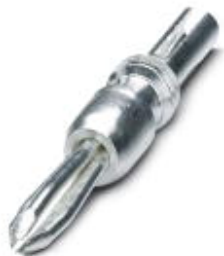
Test plugs, tin-plated surface, Color: silver

Please be informed that the data shown in this PDF Document is generated from our Online Catalog. Please find the complete data in the user's documentation. Our General Terms of Use for Downloads are valid ( http://phoenixcontact.com/download )