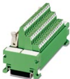
VARIOFACE module, with screw connection and flat-ribbon cable connector, for assembly on NS 35/7.5, 50 positions

Please be informed that the data shown in this PDF Document is generated from our Online Catalog. Please find the complete data in the user's documentation. Our General Terms of Use for Downloads are valid ( http://download.phoenixcontact.com )