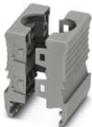
Cable housing, Length: 19.9 mm, Width: 45.5 mm, Height: 36.8 mm, Number of positions: 13, Color: gray

Please be informed that the data shown in this PDF Document is generated from our Online Catalog. Please find the complete data in the user's documentation. Our General Terms of Use for Downloads are valid ( http://phoenixcontact.com/download )