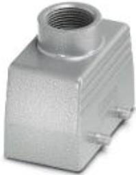
HEAVYCON sleeve housing B10, for double locking latch, height 45 mm, with support 1x M20, straight conductor exit

Please be informed that the data shown in this PDF Document is generated from our Online Catalog. Please find the complete data in the user's documentation. Our General Terms of Use for Downloads are valid ( http://download.phoenixcontact.com )