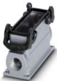
Box mounting base, with double locking latch, height 67 mm, without screw connection, 1x Pg21

Please be informed that the data shown in this PDF Document is generated from our Online Catalog. Please find the complete data in the user's documentation. Our General Terms of Use for Downloads are valid ( http://phoenixcontact.com/download )