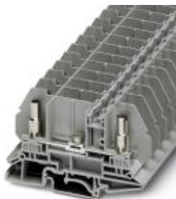
Feed-through terminal block with bolt connection, cross section: 0.1 - 6 mm 2 , AWG: 26 - 10, width 16.3 mm, color: Gray

Please be informed that the data shown in this PDF Document is generated from our Online Catalog. Please find the complete data in the user's documentation. Our General Terms of Use for Downloads are valid ( http://download.phoenixcontact.com )