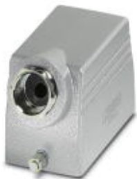
Sleeve housing, for single locking latch, height 52 mm, with screw connection, 1x Pg16, lateral cable entry

Please be informed that the data shown in this PDF Document is generated from our Online Catalog. Please find the complete data in the user's documentation. Our General Terms of Use for Downloads are valid ( http://phoenixcontact.com/download )