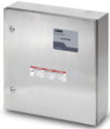
Indoor/outdoor lightning arrester and TVSS system for 120/208-240 V

Please be informed that the data shown in this PDF Document is generated from our Online Catalog. Please find the complete data in the user's documentation. Our General Terms of Use for Downloads are valid ( http://phoenixcontact.com/download )