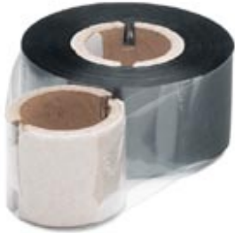
Ink ribbon, for CMS-TTP 4320, only for shrink sleeves PSS..., length 91 m, width 110 mm

Please be informed that the data shown in this PDF Document is generated from our Online Catalog. Please find the complete data in the user's documentation. Our General Terms of Use for Downloads are valid ( http://phoenixcontact.com/download )