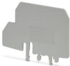
Separating plate, Length: 103 mm, Width: 2 mm, Height: 70.1 mm, Color: gray

Please be informed that the data shown in this PDF Document is generated from our Online Catalog. Please find the complete data in the user's documentation. Our General Terms of Use for Downloads are valid ( http://phoenixcontact.com/download )