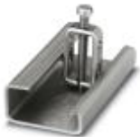
End clamp, width: 8 mm