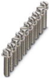
Jumper, Number of positions: 10, Color: silver

Please be informed that the data shown in this PDF Document is generated from our Online Catalog. Please find the complete data in the user's documentation. Our General Terms of Use for Downloads are valid ( http://phoenixcontact.com/download )