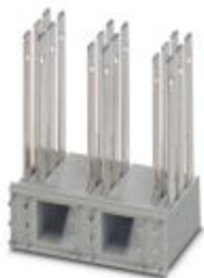
Soldering base, as connection to PCB, Color: gray

Please be informed that the data shown in this PDF Document is generated from our Online Catalog. Please find the complete data in the user's documentation. Our General Terms of Use for Downloads are valid ( http://phoenixcontact.com/download )