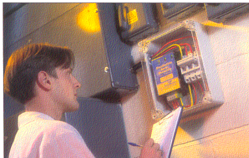
A site engineer checks the status of a Distribution Surge Protector.

Values given are at protector terminals.