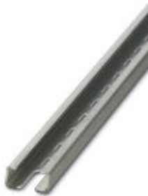
DIN rails, for accommodating cable clamps

Please be informed that the data shown in this PDF Document is generated from our Online Catalog. Please find the complete data in the user's documentation. Our General Terms of Use for Downloads are valid ( http://download.phoenixcontact.com )