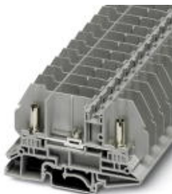
Feed-through terminal block with bolt connection, cross section: 0.1 - 6 mm 2 , AWG: 26 - 10, width 16.3 mm, color: Gray

Please be informed that the data shown in this PDF Document is generated from our Online Catalog. Please find the complete data in the user's documentation. Our General Terms of Use for Downloads are valid ( http://download.phoenixcontact.com )