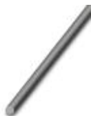
Connection pin, Length: 1000 mm, Color: gray