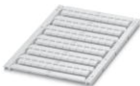
The figure shows the UCT-TMF 6 version

UniCard materials for thermal transfer printers, for labeling Weidmüller, Conta Clip, and Klemsan terminal blocks with horizontal marker groove, 60-section, can be labeled with THERMOMARK CARD and BLUEMARK LED, color: white