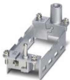
HEAVYCON hinged retaining frame, for HC-B 16 supporting base element, for 4 modules, labeling with lower case letters (a, b, c, etc.)

Please be informed that the data shown in this PDF Document is generated from our Online Catalog. Please find the complete data in the user's documentation. Our General Terms of Use for Downloads are valid ( http://download.phoenixcontact.com )