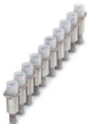
Fixed bridge, Number of positions: 2, Color: green

Please be informed that the data shown in this PDF Document is generated from our Online Catalog. Please find the complete data in the user's documentation. Our General Terms of Use for Downloads are valid ( http://phoenixcontact.com/download )