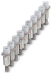
Fixed bridge, Number of positions: 3, Color: blue

Please be informed that the data shown in this PDF Document is generated from our Online Catalog. Please find the complete data in the user's documentation. Our General Terms of Use for Downloads are valid ( http://phoenixcontact.com/download )