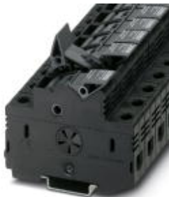
Fuse terminal block with light indicator, for cartridge fuse insert 10.3 x 38 mm, cross section: 1.5 - 25 mm 2 , AWG: 16 - 4, width: 18 mm, color: Black

Please be informed that the data shown in this PDF Document is generated from our Online Catalog. Please find the complete data in the user's documentation. Our General Terms of Use for Downloads are valid ( http://download.phoenixcontact.com )