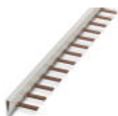
Insertion bridge, Number of positions: 56, Color: gray