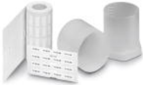
The figure shows the EML (20X8)R product variant

Label, Roll, transparent, unlabeled, can be labeled with: THERMOMARK ROLL, THERMOMARK ROLL X1, THERMOMARK X, THERMOMARK S1.1, Mounting type: Adhesive, Lettering field: 51 x 12.5 mm