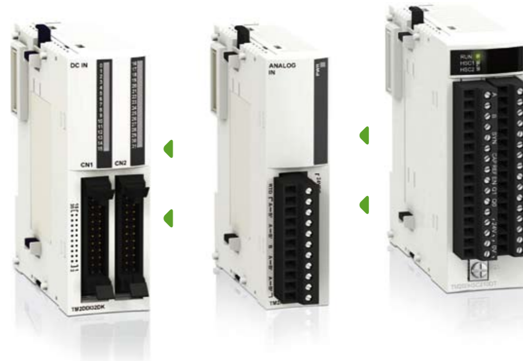
Fast-counting expansion module