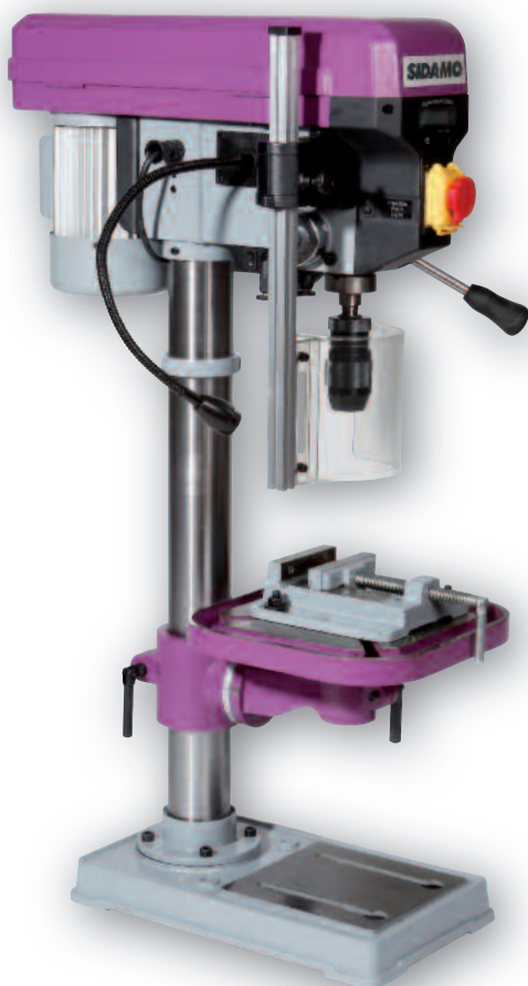
..... PE 22 A