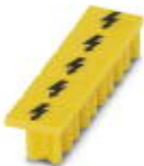
Warning cover, 5-pos., for terminal width: 5.2 mm

Zack Marker strip, flat - ZBF 5 CUS - 0825025