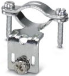
Strain relief clamps contact inserts of series: B-, BB-, D 40, D 64, DD and HV, lateral cable exit

Please be informed that the data shown in this PDF Document is generated from our Online Catalog. Please find the complete data in the user's documentation. Our General Terms of Use for Downloads are valid ( http://phoenixcontact.com/download )