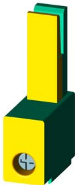
PE PICK OFF, CONNECTION MAIN CIRCUIT: SCREW TERMINAL,