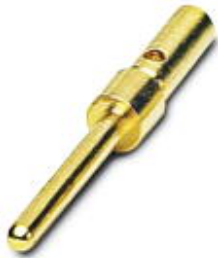
Crimp contact, for D-SUB contact inserts with standard contact density, pin, connection cross section AWG 24 ... 20, turned, gold-plated

Please be informed that the data shown in this PDF Document is generated from our Online Catalog. Please find the complete data in the user's documentation. Our General Terms of Use for Downloads are valid ( http://download.phoenixcontact.com )