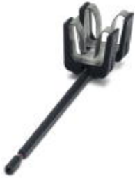
Shield connection clamp, Color: black

Please be informed that the data shown in this PDF Document is generated from our Online Catalog. Please find the complete data in the user's documentation. Our General Terms of Use for Downloads are valid ( http://phoenixcontact.com/download )