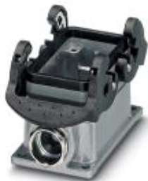
Box mounting base, with double locking latch, height 52 mm, with screw connection, 1x Pg16

Please be informed that the data shown in this PDF Document is generated from our Online Catalog. Please find the complete data in the user's documentation. Our General Terms of Use for Downloads are valid ( http://phoenixcontact.com/download )