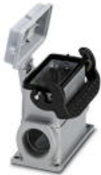
Box mounting base, with single locking latch, height: 74 mm, with gland, 1 x Pg21, with protective cover

Please be informed that the data shown in this PDF Document is generated from our Online Catalog. Please find the complete data in the user's documentation. Our General Terms of Use for Downloads are valid ( http://phoenixcontact.com/download )