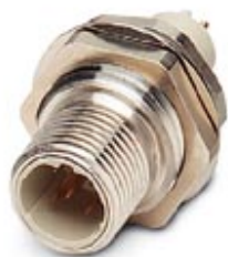
Sensor/Actuator flush-type plug, 5-pos., M12, B-coded, rear/screw mounting with Pg9 thread, with straight solder connection

Please be informed that the data shown in this PDF Document is generated from our Online Catalog. Please find the complete data in the user's documentation. Our General Terms of Use for Downloads are valid ( http://download.phoenixcontact.com )