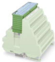
Replacement module electronics for IB ST (ZF) 24 DO 32/2

Please be informed that the data shown in this PDF Document is generated from our Online Catalog. Please find the complete data in the user's documentation. Our General Terms of Use for Downloads are valid ( http://download.phoenixcontact.com )