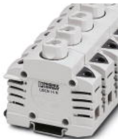
Fuse terminal blocks for NEOZED fuse inserts

Please be informed that the data shown in this PDF Document is generated from our Online Catalog. Please find the complete data in the user's documentation. Our General Terms of Use for Downloads are valid ( http://phoenixcontact.com/download )