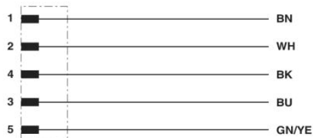
Contact assignment of the M12 plug