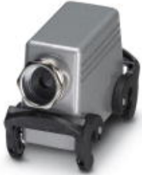
Hood, with double locking latch, height 65 mm, with screw connection, 1x Pg21, lateral cable entry

Please be informed that the data shown in this PDF Document is generated from our Online Catalog. Please find the complete data in the user's documentation. Our General Terms of Use for Downloads are valid ( http://phoenixcontact.com/download )