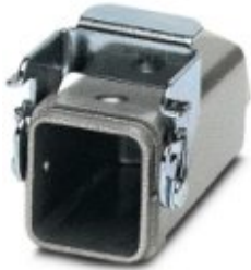
Coupling housing, with single locking latch, height 61 mm, without screw connection, 1 x Pg11, zinc die-cast

Please be informed that the data shown in this PDF Document is generated from our Online Catalog. Please find the complete data in the user's documentation. Our General Terms of Use for Downloads are valid ( http://phoenixcontact.com/download )