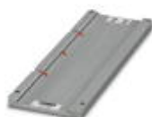
Magazine, for CMS-P1-PLOTTER, for accommodating UC-TMF..., UC1-TMF..., UC-WMT...