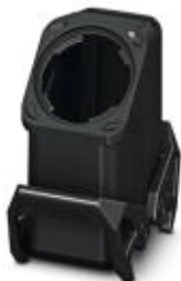
HEAVYCON EVO coupling housing, plastic, with bayonet flange for EVO screw connection, B10, with double locking latch, height: 90 mm, without EVO screw connection

Please be informed that the data shown in this PDF Document is generated from our Online Catalog. Please find the complete data in the user's documentation. Our General Terms of Use for Downloads are valid ( http://phoenixcontact.com/download )