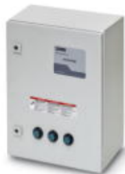
Combination lightning arrester and TVSS system for ungrounded 480 V Delta systems

Please be informed that the data shown in this PDF Document is generated from our Online Catalog. Please find the complete data in the user's documentation. Our General Terms of Use for Downloads are valid ( http://phoenixcontact.com/download )