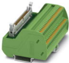
VARIOFACE interface module, with push-in connection and light indicator, for 32 channels

Please be informed that the data shown in this PDF Document is generated from our Online Catalog. Please find the complete data in the user's documentation. Our General Terms of Use for Downloads are valid ( http://phoenixcontact.com/download )