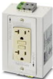
Rail-mountable double socket

Please be informed that the data shown in this PDF Document is generated from our Online Catalog. Please find the complete data in the user's documentation. Our General Terms of Use for Downloads are valid ( http://download.phoenixcontact.com )