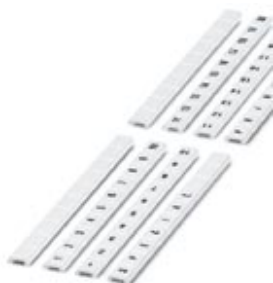
Zack Marker strip, flat, Strip, white, Unlabeled, Can be labeled with: Plotter, Mounting type: Snap into flat marker groove, For terminal block width: 8 mm, Lettering field: 5.15 x 8.15 mm

Please be informed that the data shown in this PDF Document is generated from our Online Catalog. Please find the complete data in the user's documentation. Our General Terms of Use for Downloads are valid ( http://download.phoenixcontact.com )