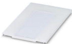
The figure shows the white version

Insert label, Sheet, white, unlabeled, can be labeled with: BLUEMARK CLED, Mounting type: snapped into marker carrier, Lettering field: 90 x 38 mm